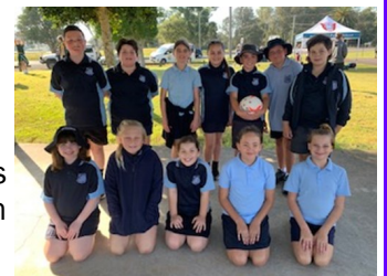
Netball NSW Schools Cup Team

You Can Do It: Resilience Confidence Organisation Persistence Getting Along Quality Work