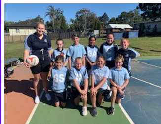
PSSA Netball Team