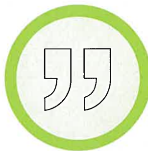
Conventions of language (spelling, grammar and punctuation)